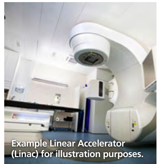
Example Linear Accelerator (Linac) for illustration purposes.

New Cancer Assessment Unit: Work to provide a new Cancer Assessment Unit (CAU) within the existing building is almost complete. A new air handling unit was successfully installed over the summer. The CAU is due to open in winter and will provide an easily accessible, modern, fit for purpose unit for patients and staff.