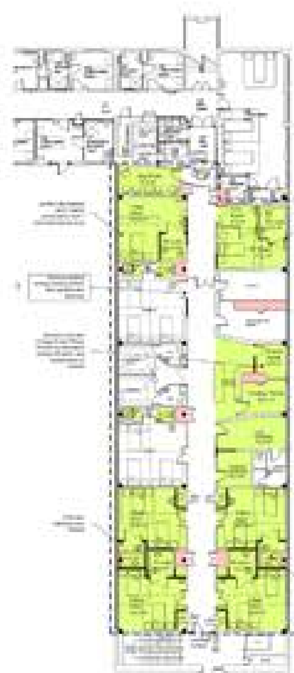
First Floor - Ward 2