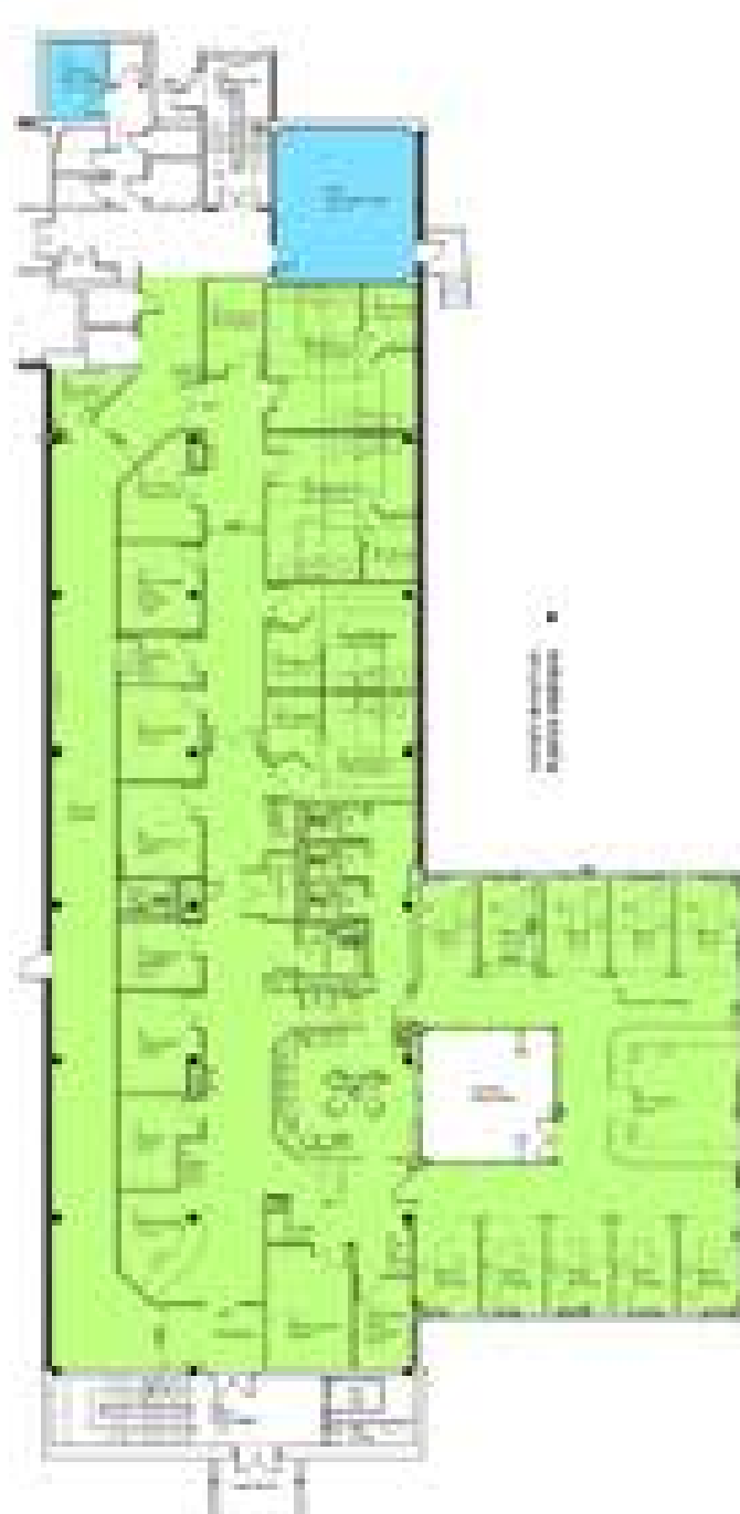
Ground Floor - CAU