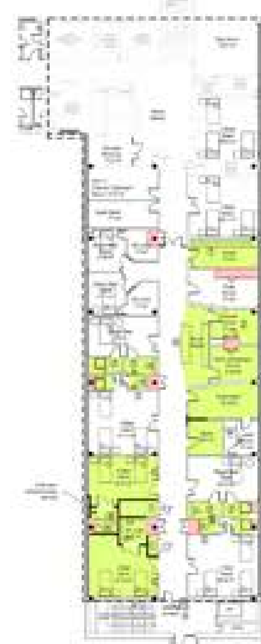
Second Floor - Ward 4